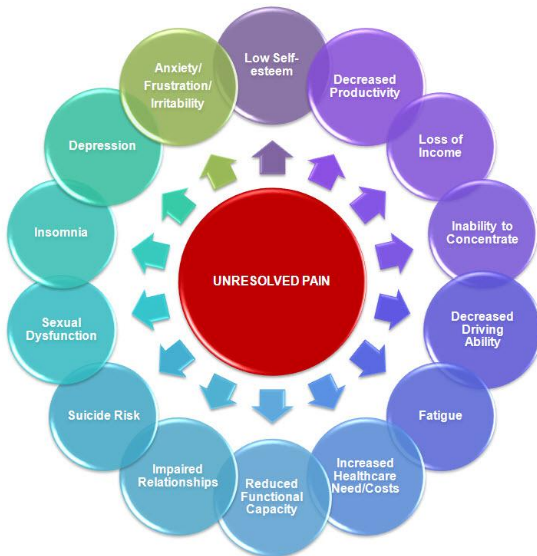
Figure 2. Consequences of Unresolved Pain.

The first portion of this article presents a very basic review of the pharmacology of the cannabinoids and endocannabinoid receptor system, drawing both from animal and human models. 6 Although cannabinoids have putative therapeutic